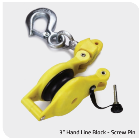
3" Hand Line Block - Screw Pin