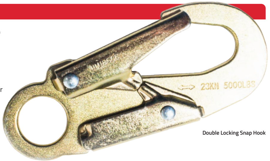
Double Locking Snap Hook

The Hand Line Hook is made of manganese bronze, and is made for use with 1/2" (12.7 mm) rope.