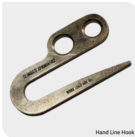
Hand Line Hook