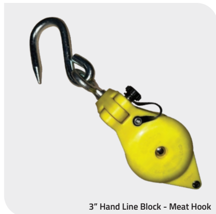
3" Hand Line Block - Meat Hook